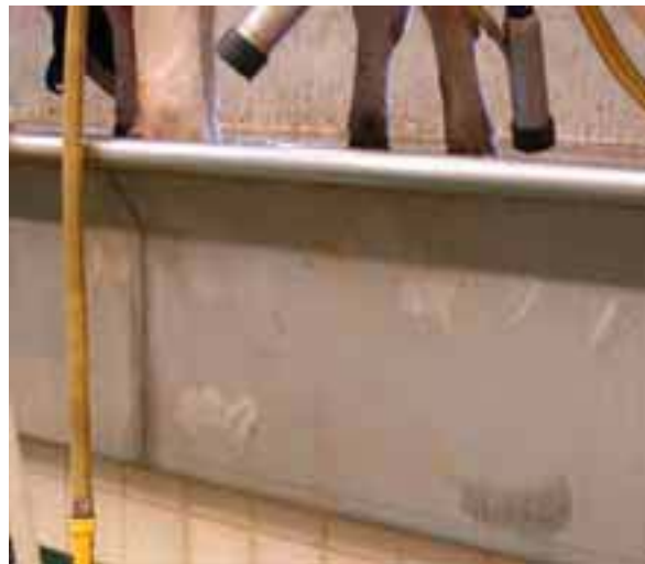
60 days after treatment, scale was entirely removed and no new scale was formed.