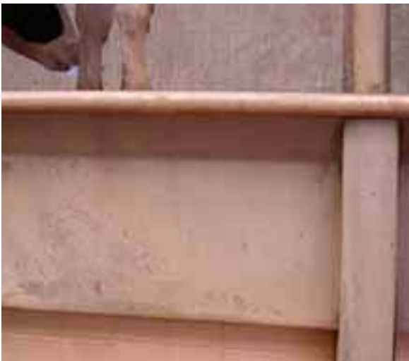
Initial hard deposits on the wall forms within a few days.

Facility treatment over 60 days resulted in regular progression of descaling, and increasing ORP values throughout the facility. Descaling was apparent in all areas that resulted in direct cost reduction, chemical usage, maintenance labor, improved efficiency and food safety.